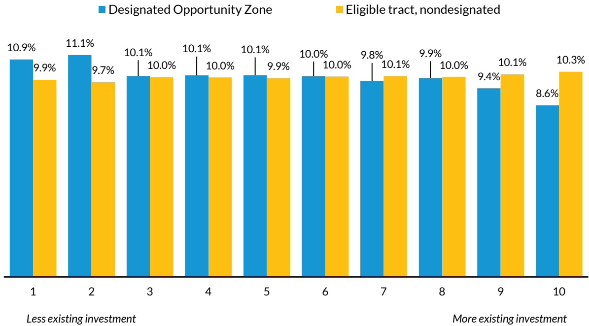
FIGURE 1 Investment Score Distribution of Opportunity Zones