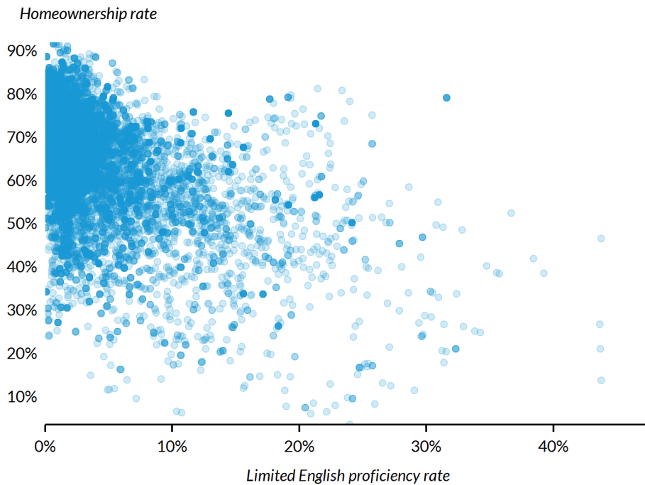
FIGURE 1 Homeownership Rates and Limited English Proficiency Concentration in Zip Codes

Source: American Community Survey 2015, retrieved from the Urban Institute Sloan Administrative Data Research Facility database.