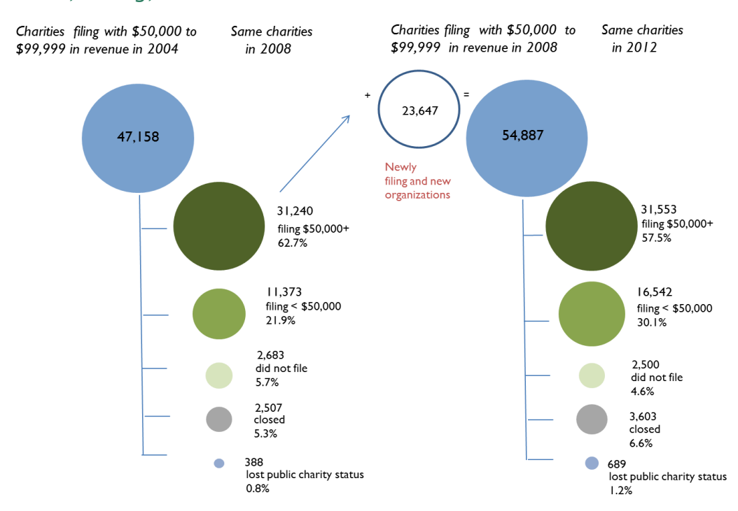
Figure 1. Tracking Public Charities with $50,000-$99,999 in Revenue before, during, and after the 2007-10 Recession