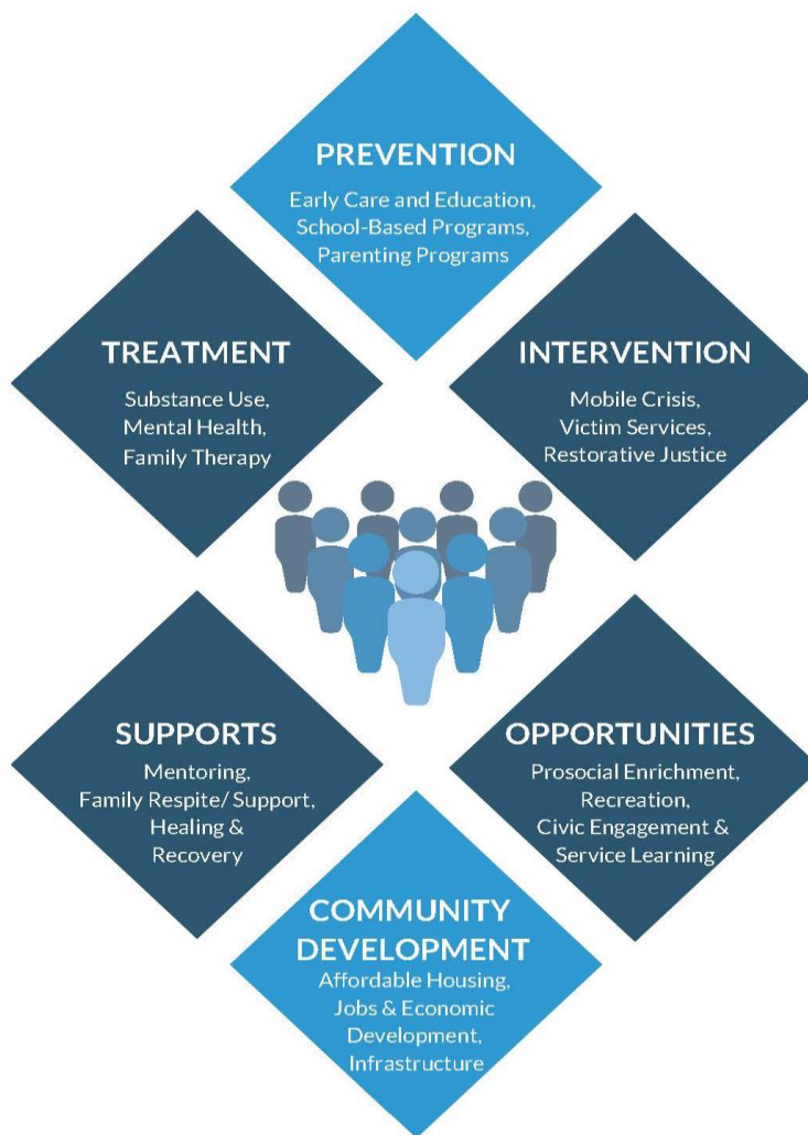
FIGURE 1 Continuum of Care