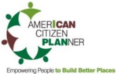
American Citizen Planning Program at MSU