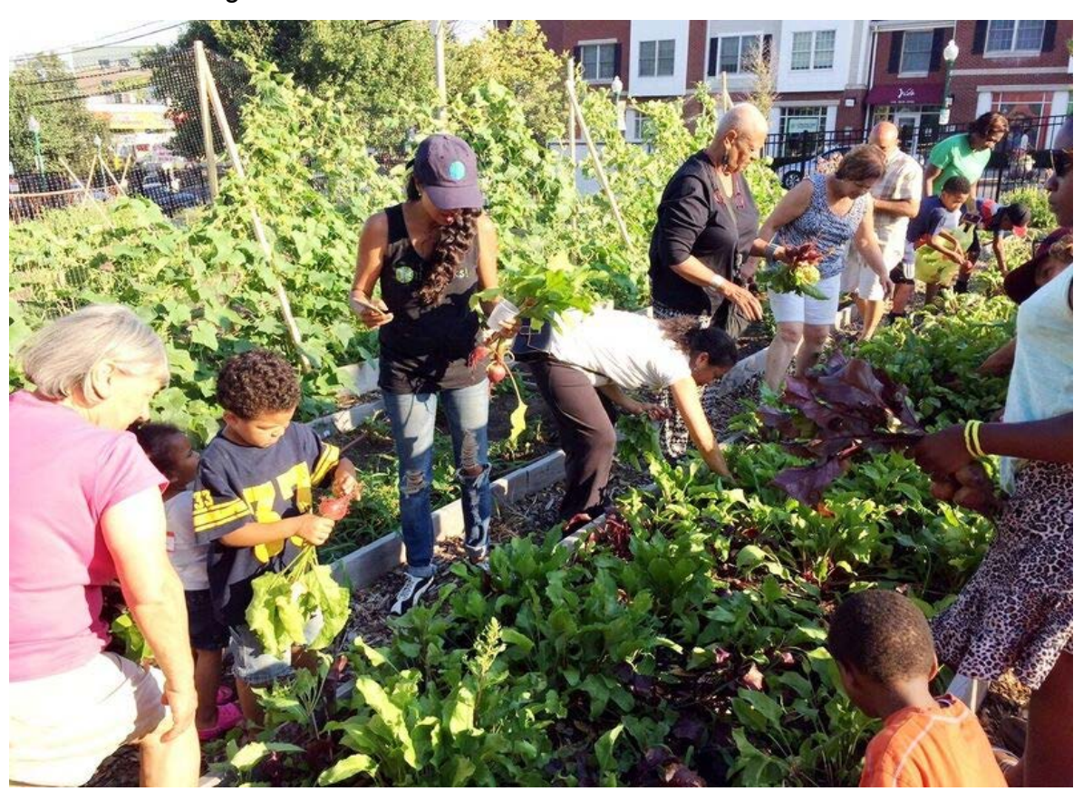
FIGURE 3 Beet Harvest at Fairgate Farm

Locals (COC and non-COC residents alike) are encouraged to tour the farm and are asked to volunteer their time or areas of expertise. Charter Oak Communities explains its approach as providing "neighborly love" to help people feel comfortable and cared for to set a foundation for deeper engagement on things like nutrition and healthy eating. The farm combines the ability to be outdoors and engage in healthy and enjoyable physical activity and is a learning environment where people receive information about gardening, composting, and soil science. The Collaborative also sees the farm as an opportunity for professional growth and job development. More than growing vegetables, the partners see the farm as growing community.