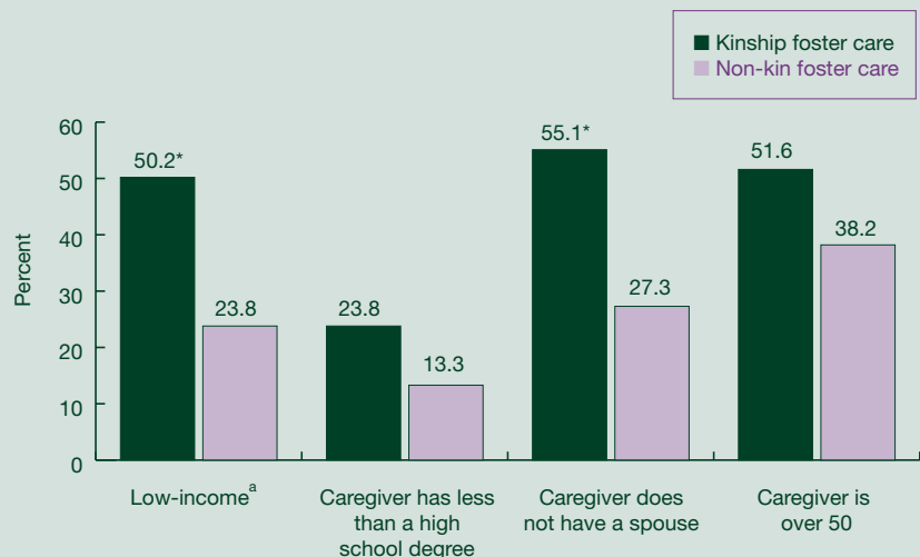
Figure 2. Demographic Hardships Faced by Children in Kinship and Non-Kin Foster Care